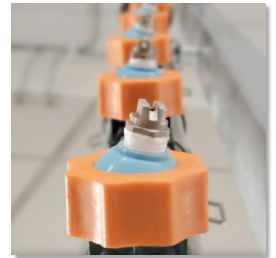
Embedded spray nozzles